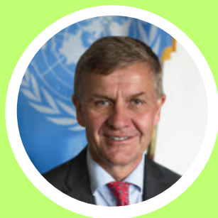
Erik Solheim Chairman -The sixth and former UN Environment Executive Director and under secretary-General of the United Nations